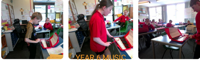
YEAR 6 MUSIC