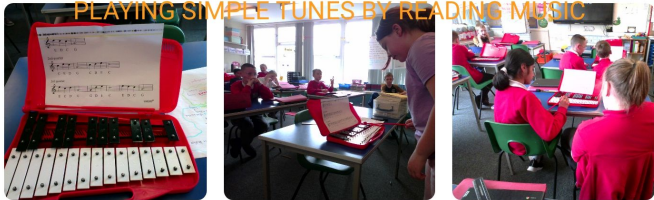
PLAYING SIMPLE TUNES BY READING MUSIC