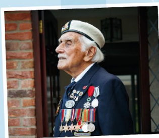
Two minute silence