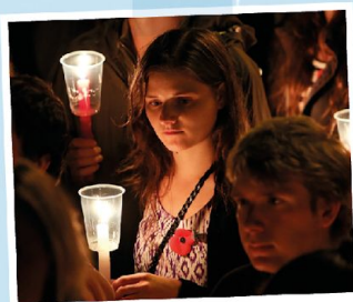
Marking a special day