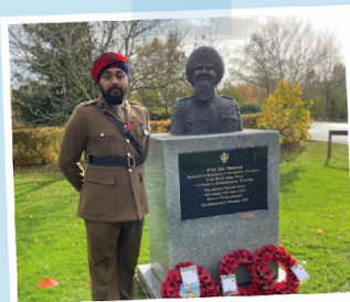
Visiting a monument or special place