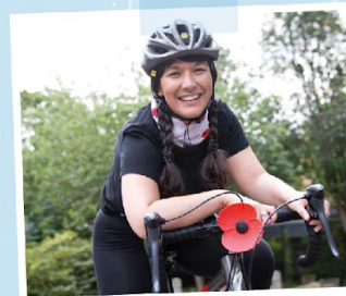
Wearing a poppy

Which of these photos shows an act of Remembrance?