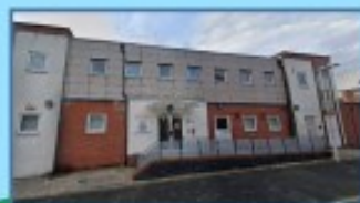
Riverbank Family Hub