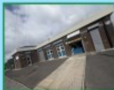
Moor Nook Family Hub and Youth Zone