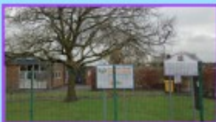
Preston West Family Hub

You may recognise some of our Family Hub locations or have visited them before. That's because Family Hubs are taking the place of our children and family wellbeing and neighbourhood centres, so that we can expand what we offer. So don't worry, you won't have to travel anywhere new, and support is still local to you.