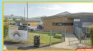
Ribblesdale Family Hub