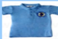
Pale Blue Polo Shirt