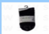
Grey Socks or Tights