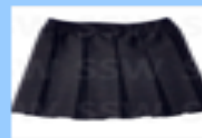
Grey Skirt or Dress