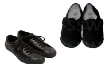
Plain black trainers or pumps

NO jewellery to be worn during PE sessions