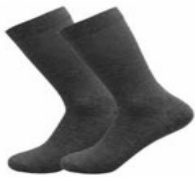
Grey or black socks or tights