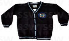
Navy blue school cardigan