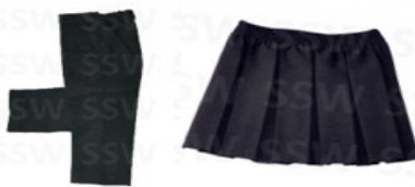
Grey trousers or skirt