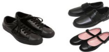
Plain black trainers or shoes