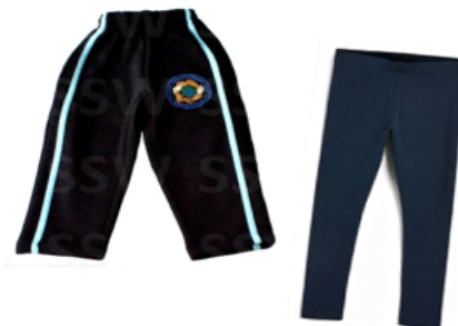
Navy jogging bottoms or leggings