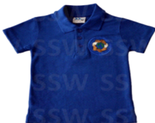
Royal blue t-shirt