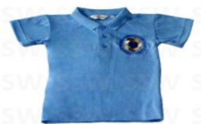
Pale blue t-shirt