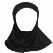
Black or navy head scarf