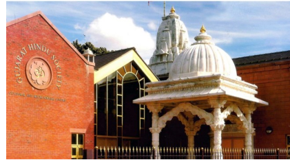
A Hindu place of worship is called a Mandir