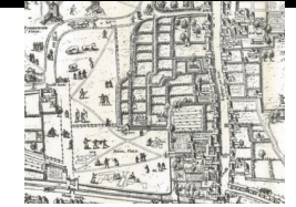
Birds Eye view