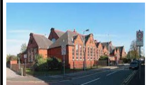
Deepdale Community Primary School