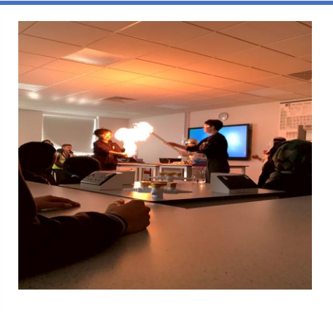
A group of our year 6 children visited PMGHS to take part in a science workshop. It was one of the most fascinating experience for them, as they observed the result of chemical reactions.