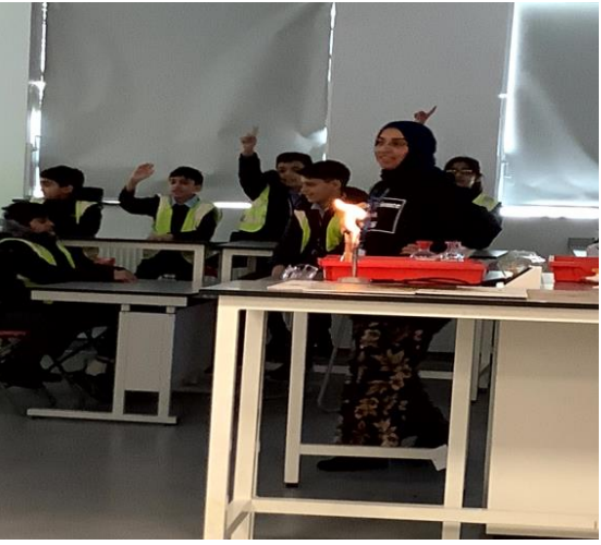
Toothpaste for the elephant This was just incredible as 3 substances were mixed: hydrogen peroxide, washing up liquid and potassium iodide. We saw a huge bubble form, looking like toothpaste. It looked magical, but it was science