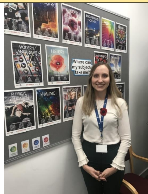
Meet our Careers advisor!