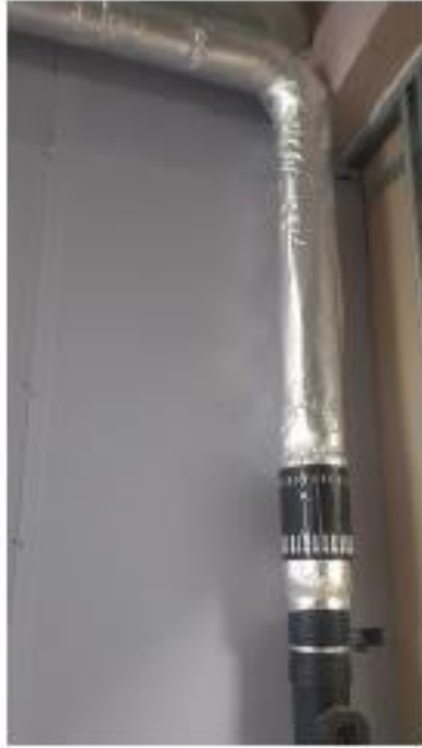
Rainwater lagging underway