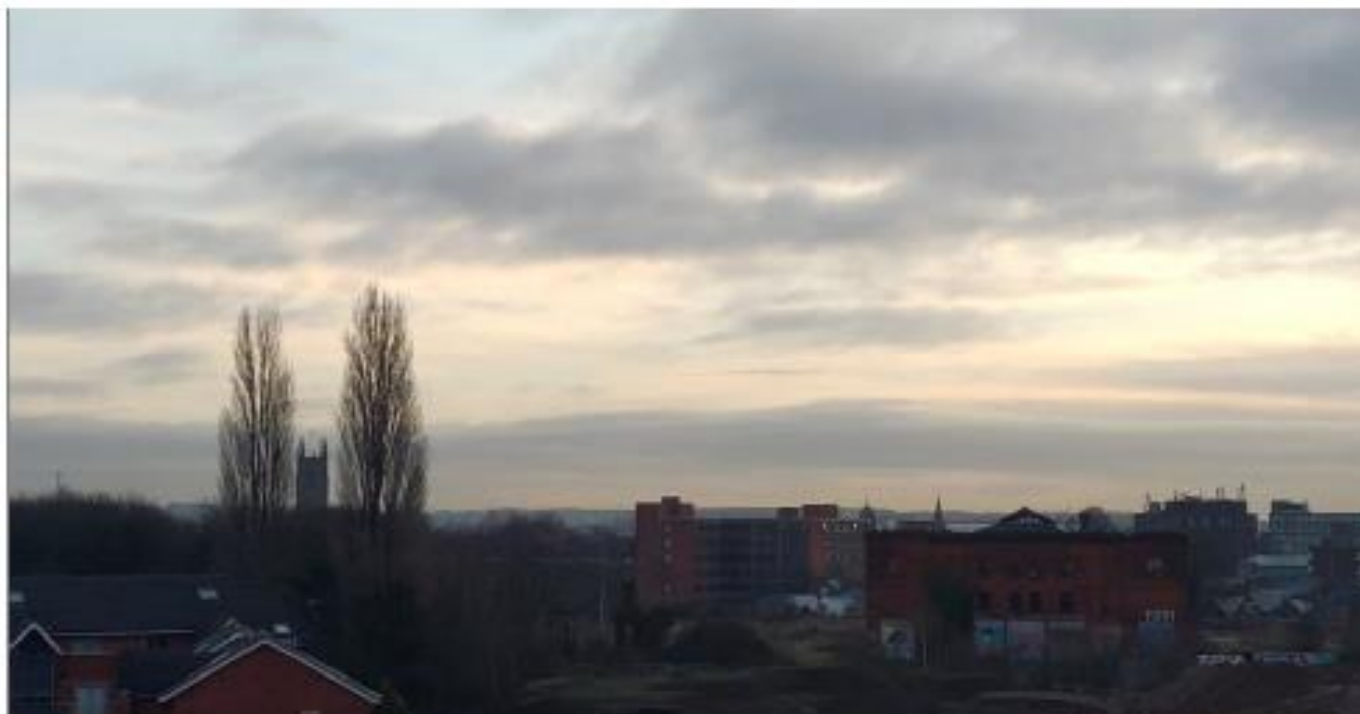
Early morning view from the roof to Derby Cathedral