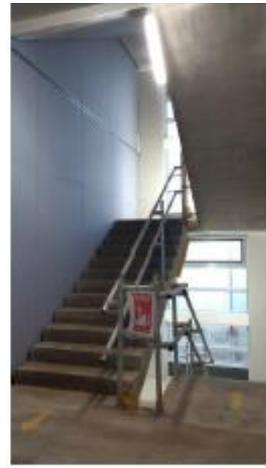
Stair cores now being boarded ready for plaster after patress install