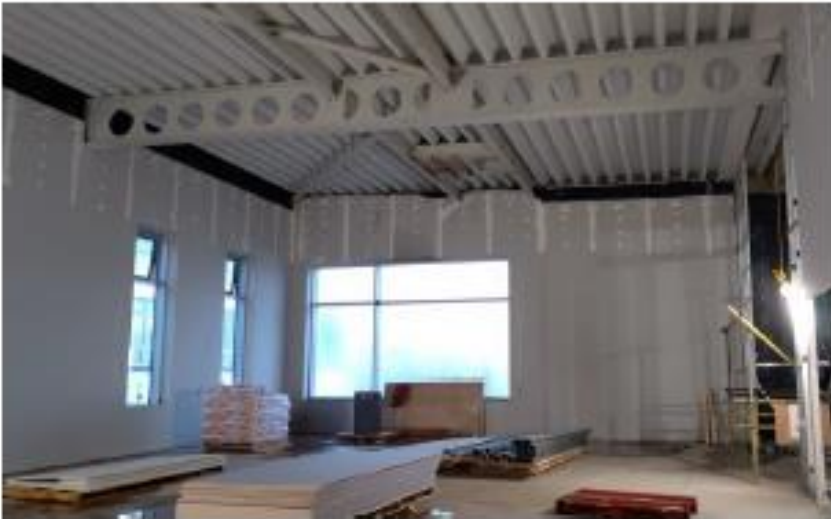
Boarding and taping to the Gym activity room