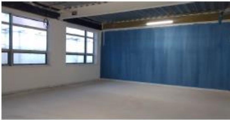
Typical corridor, data and wiring ongoing, followed by testing and lagging. Classroom decorations, dado and wiring