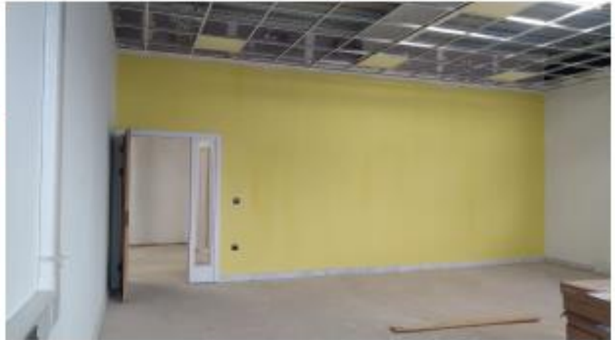
Ceiling grid, lighting and dado