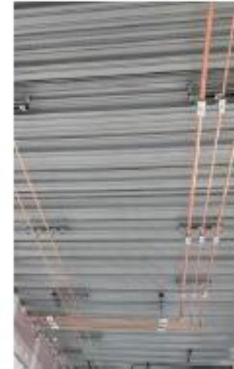
Domestic pipework to classrooms