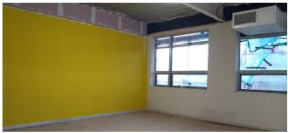
↑ Carpentry, decorations ? And NVHR install