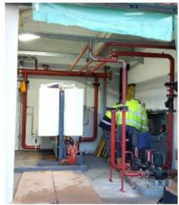
Plant room install ↑