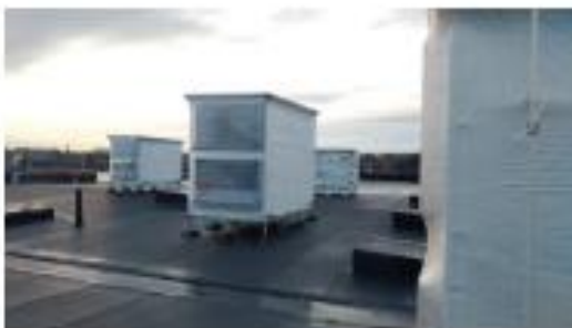
AHU's now sited