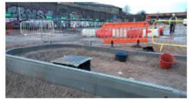
Rear carpark prep work for asphalt in the next period →