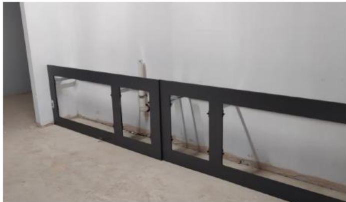
IPS for toilet sinks