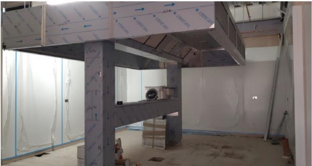
Main kitchen canopy install and hygienic cladding installed