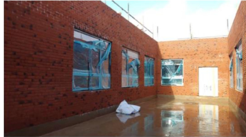
Science Terrace brickwork completed, scaffold struck, prep for roof covering →