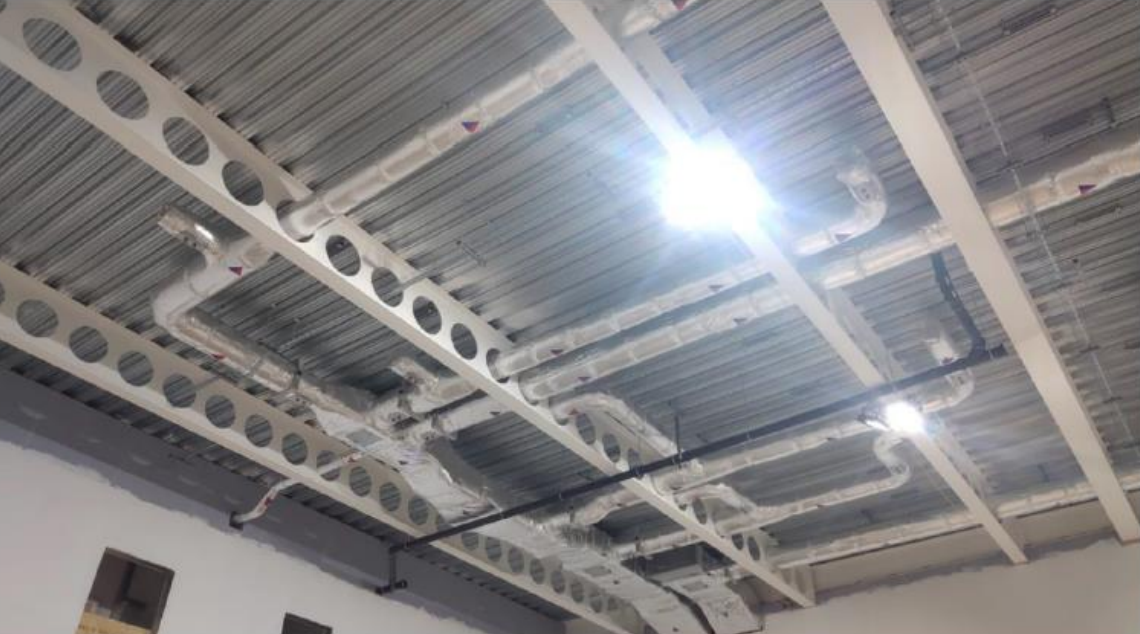
Lagging to ductwork well underway with many areas completed