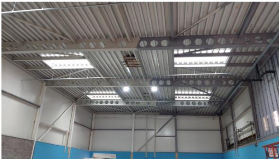
Fire alarm installation ➔