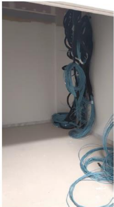
Server rooms painted with casings, data being installed