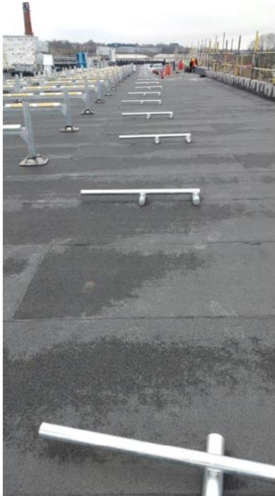
↑ Permeant edge protection being installed