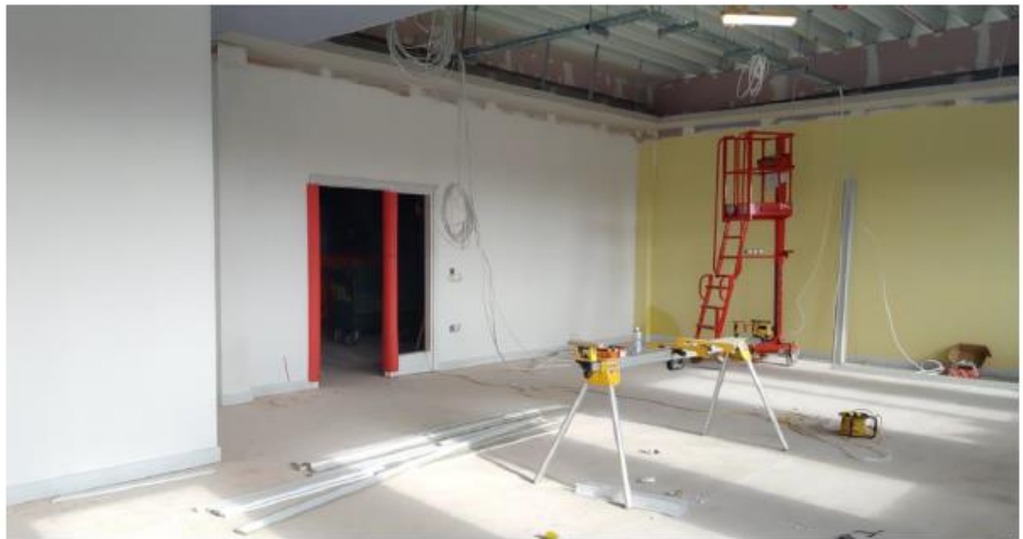
↑ Electrical and Mechanical ceiling works ongoing. Note casing protection in place