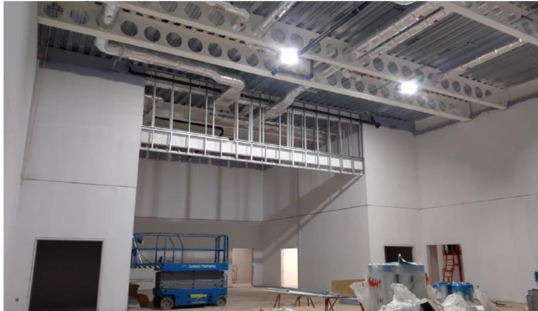
Main hall decorations and first fix sliding partition install ←