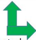
Heated rooms have allowed floor prep, dpm and latex screed to science