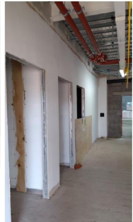
Sports hall changing decorations ongoing ↑