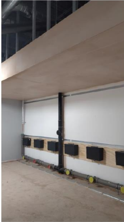
IPS track and panels have now commenced to the toilets with bulkhead ceilings complete