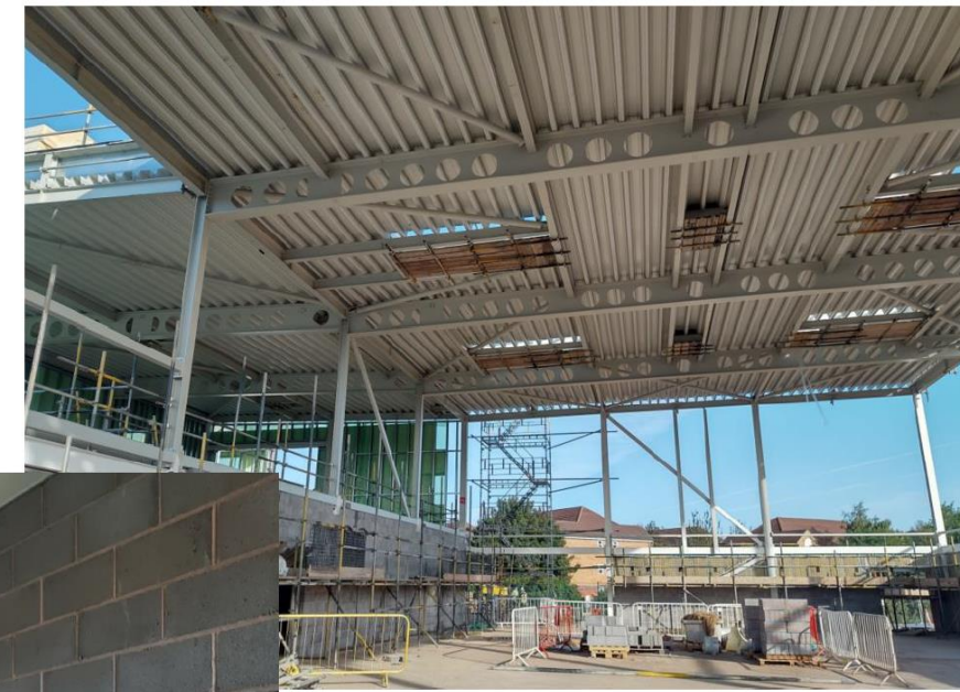
Inside sports hall blockwork and scaffold