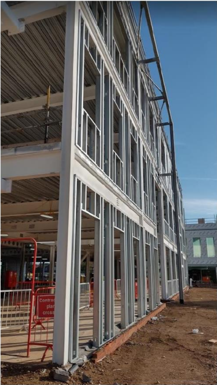
Final SFS framing to south East section