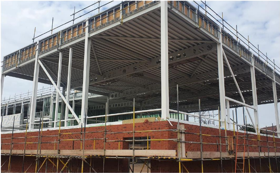
Sports hall roof membrane operations ongoing, brickwork to façade now complete