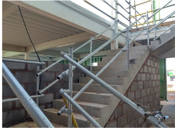
Inside blockwork to sports changing and stairs to fitness suite