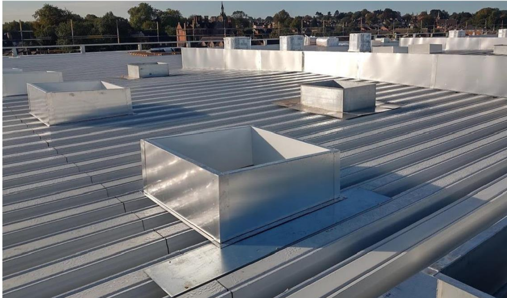
Roof light upstands installed to main roof