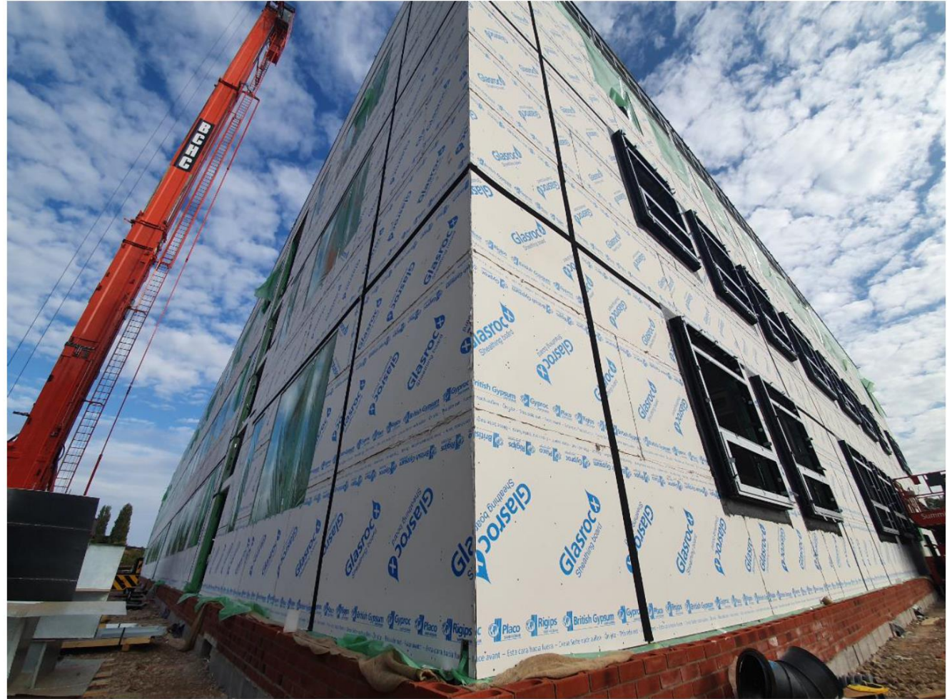
West and North elevation with windows being installed to the west