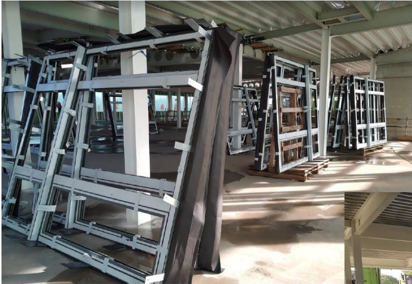
Sports hall north elevation operations