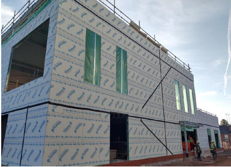
↑ Sports hall SFS west installed