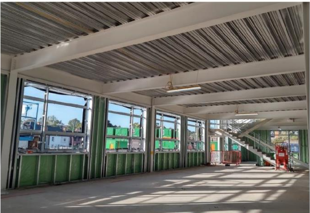
Slabs now cleared for internal wall installations