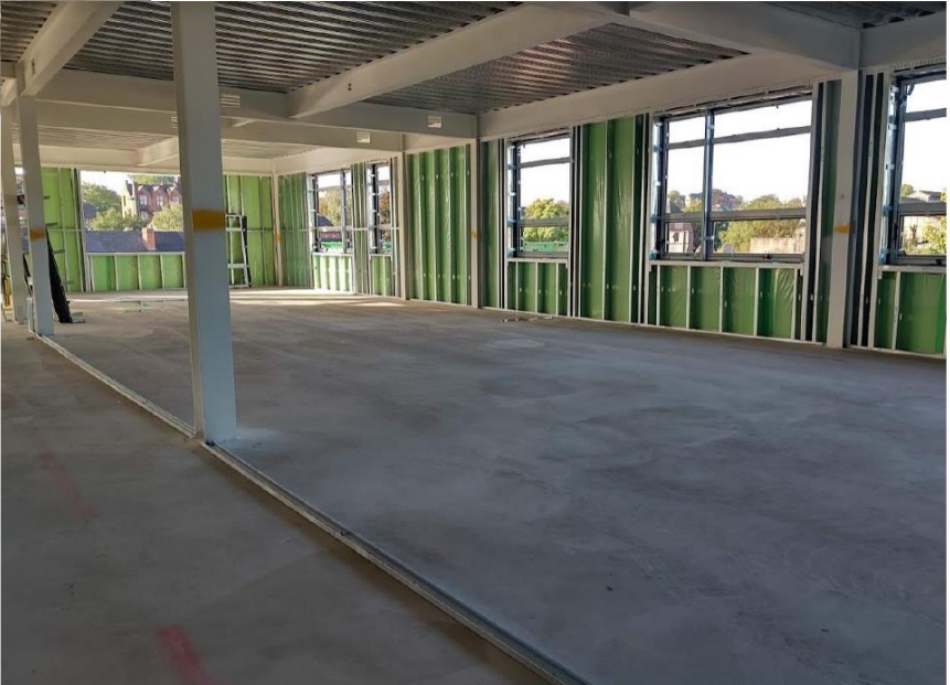
Base track for internal walls now commenced