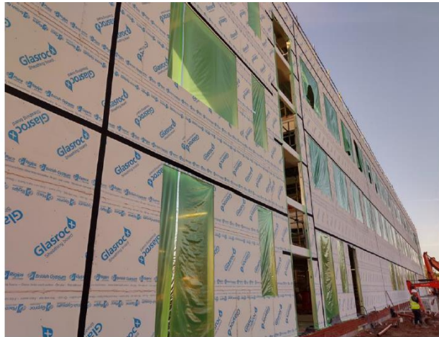
North elevation main school SFS complete