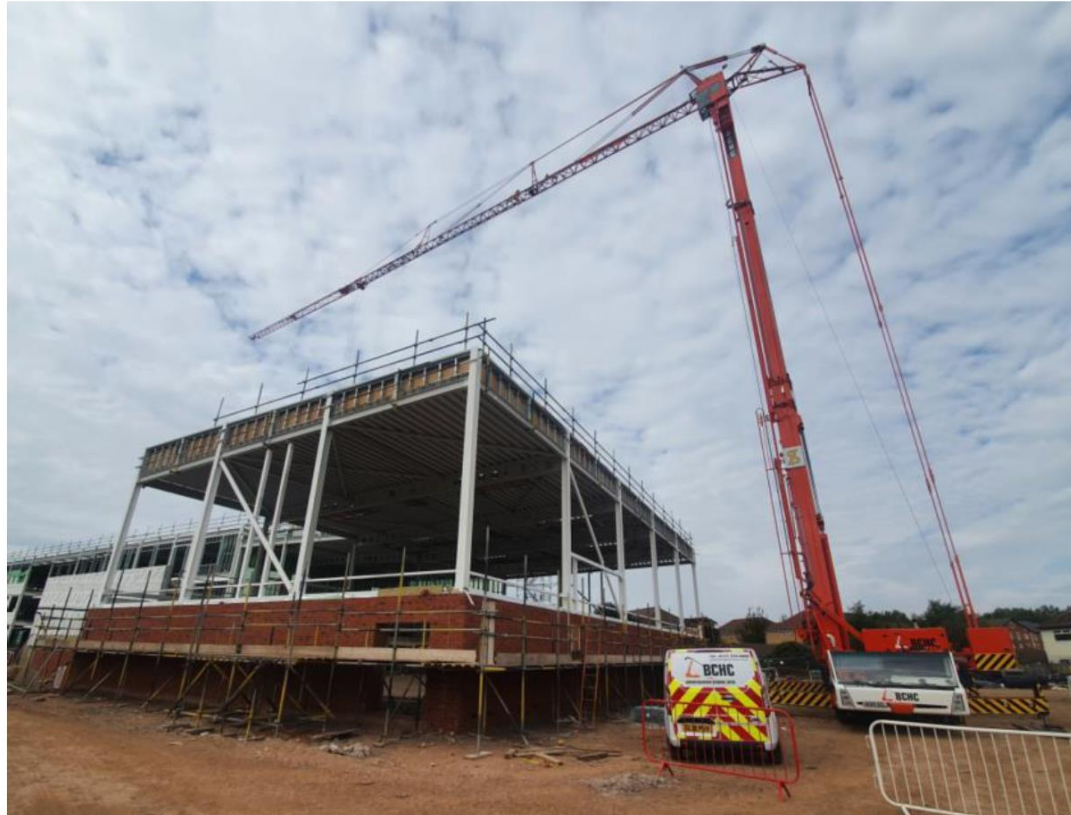
Roof materials being loaded onto the roof. Note cladding due Mid October to the remaining façade of the sports hall