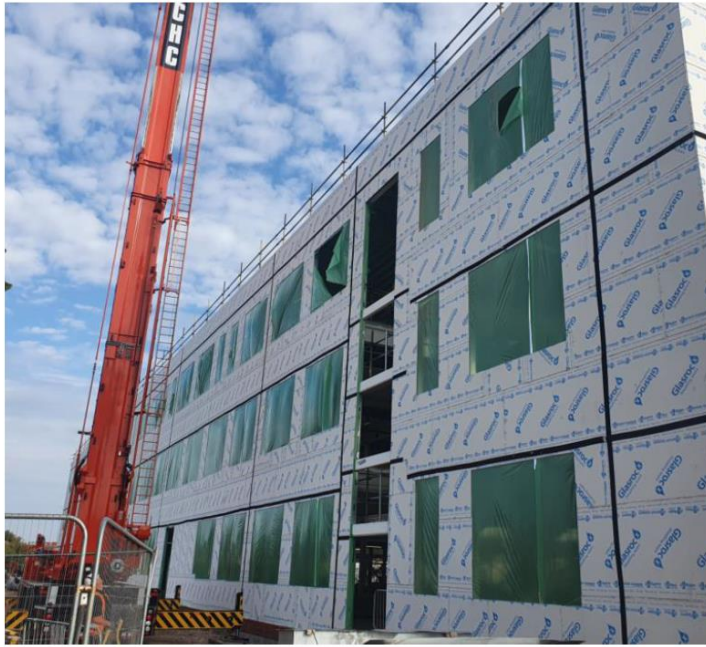
North elevation SFS now complete