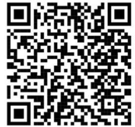
Let's Discuss: Islamist Extremism