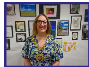
Mayor of Devizes with our student's work

This was a wonderful evening that over 100 people visited! Parents, students, grandparents, siblings and local councillors and the Mayor of Devizes attended.