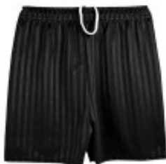
plain black jogging bottoms