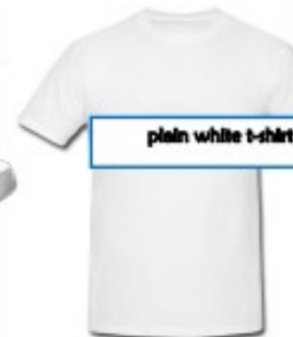
plain white t-shirt