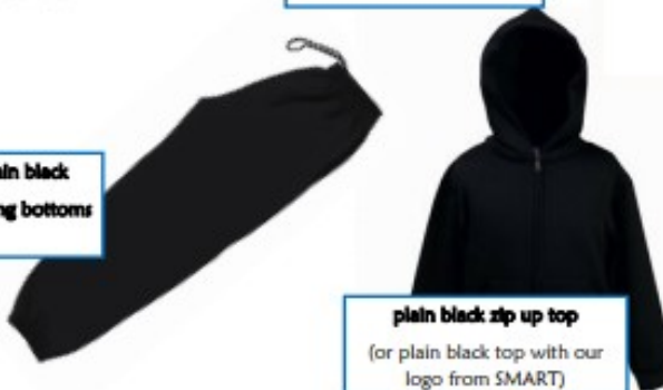
plain black zip up top (or plain black top with our logo from SMART)