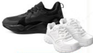
Black or white plain trainers