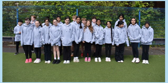
Y11HBD were awarded class of the week W/C 04/05/26 with an excellent 99.2% Attendance—Well done!