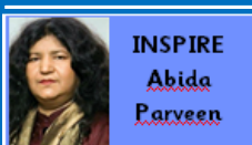
INSPIRE Abida Parveen