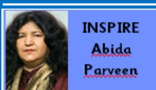
INSPIRE Abida Parveen