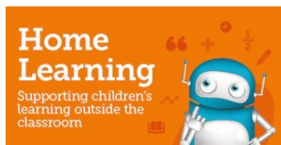
New to the range:

Why not take the opportunity to visit the Scholastic website and find out what amazing 'outside of the classroom' learning resources they provide.