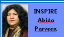
INSPIRE Abida Parveen