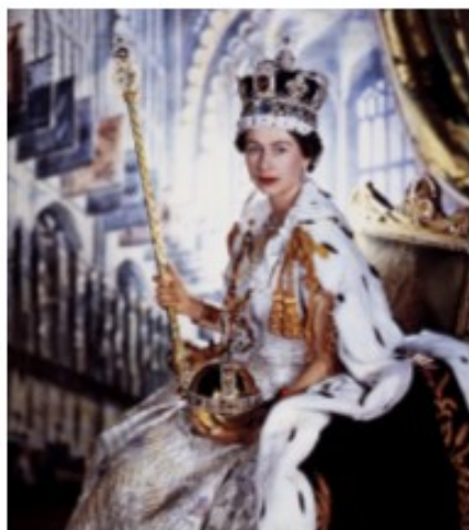
Queen Elizabeth II 1926-2022

Welcome back to all of our wonderful families, and welcome to the new families who are joining us this year. Staff have been working hard over the last few weeks to ensure that the school is bright and engaging ready for another year of exciting learning challenges. We are thrilled with how well the children have settled back into school. Teachers report that children are working hard and impressing them with excellent attitudes towards learning and kind behaviour towards each other. It is also great to see all children in full uniform. We want to maintain these high standards as we move throughout the year - especially with black footwear as this enables us to have a level playing field with all children, regardless of financial situations.