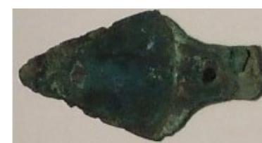
An early copper arrowhead