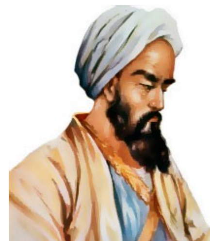
Abu Bakr Al-Razi