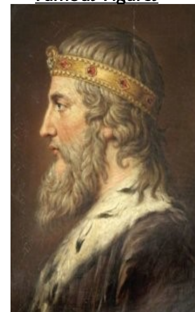
Alfred the Great