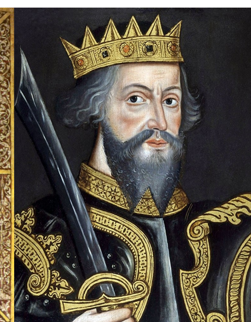
William the Conqueror