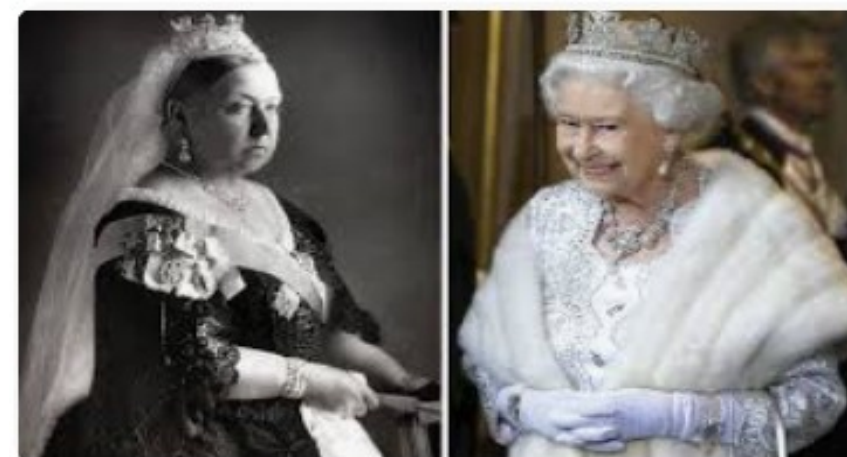
Queen Victoria Queen Elizabeth II