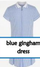
blue gingham dress