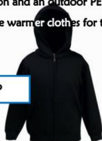
plain black zip up top

You are welcome to send in some warmer clothes for the outdoor sessions.