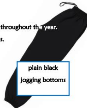
plain black jogging bottoms