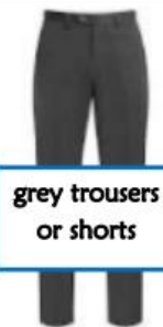
grey trousers or shorts