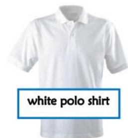
white polo shirt

School uniform promotes equality and gives children an added sense of belonging. One of our school aims is to "be the best we can be". All children coming to school prepared for the day and taking a pride in how smart they are enables us to strive to achieve this aim.