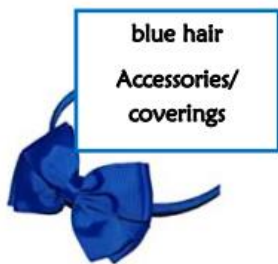
blue hair Accessories/ coverings