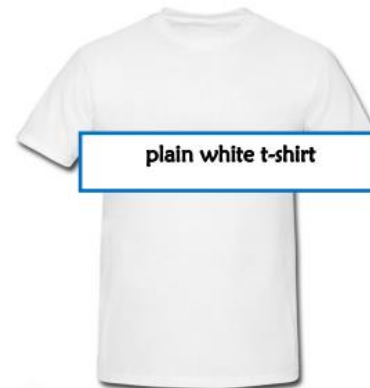
plain white t-shirt