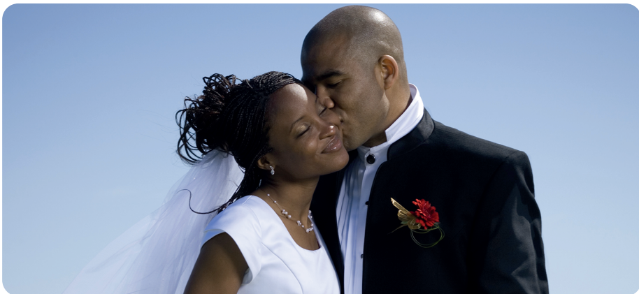
Weddings happen when two adults get married.