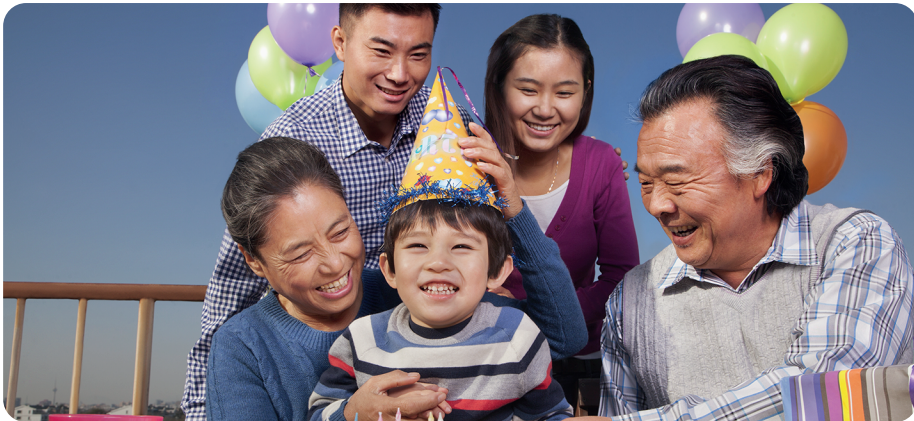
Birthdays happen every year.

Important life events include birthdays, religious festivals or family celebrations. Some life events happen every year and some happen at certain stages of human life.