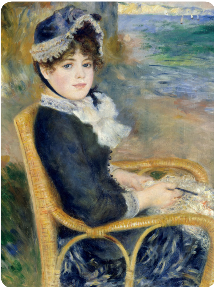
The textures of these two portraits are similar but the colours are different.