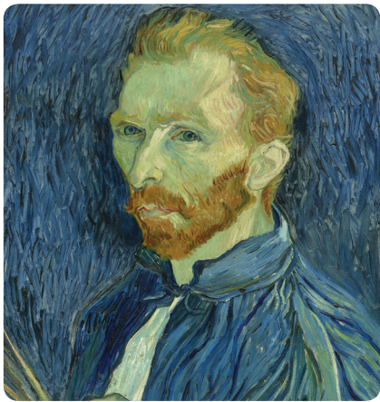
Self-portrait, Vincent van Gogh, 1889

A self-portrait is a portrait that an artist produces of themselves. Vincent van Gogh painted many self-portraits.