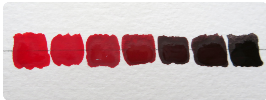
shades of red

A shade is a colour mixed with black. The more black paint that is added to the original colour, the darker the shade. A shade can range from slightly darker than the original colour, to nearly black. When mixing a shade, begin with the pure colour and add black paint a tiny bit at a time.