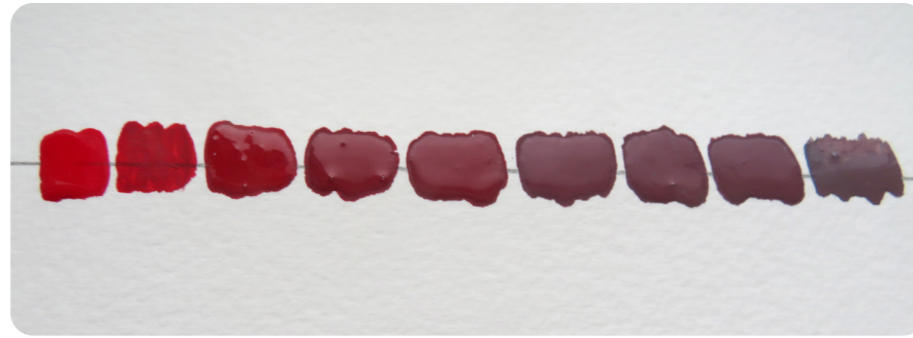
tones of red

A tone is a colour mixed with grey. Tones are less vibrant than the original colour. Using a tonal colour in a painting balances other intense colours and bright hues. When mixing a tone, begin with the pure colour and add grey paint a tiny bit at a time.