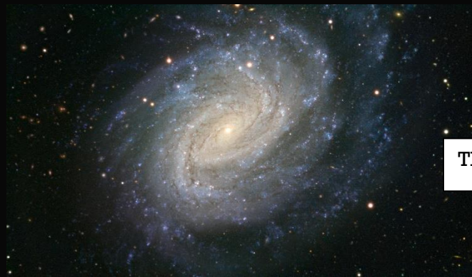
This is the Stranger Way

Are you bored of planets in our solar system? Yes? Then read on and enter the Stranger-Way-the milky way's nearest galaxy) and explore Twirl + XL! Twirl is located inside the Goldilocks-zone. If you want to get there, you're in luck but it will take 7,671 weeks to get there (around 20 years).