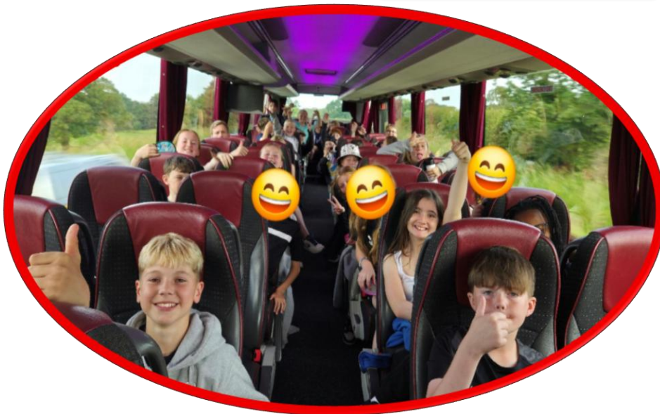
Year 6 on their way to their PGL adventure weekend! They will have loads of fun doing the activities!!!