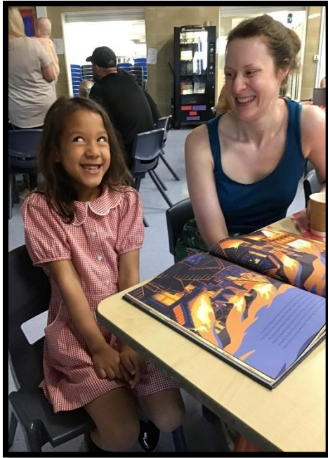
Some reading café pics from this week