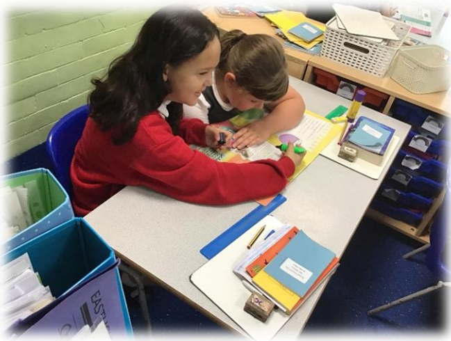
Rowan class have been looking at newspaper reports in preparation of writing their own