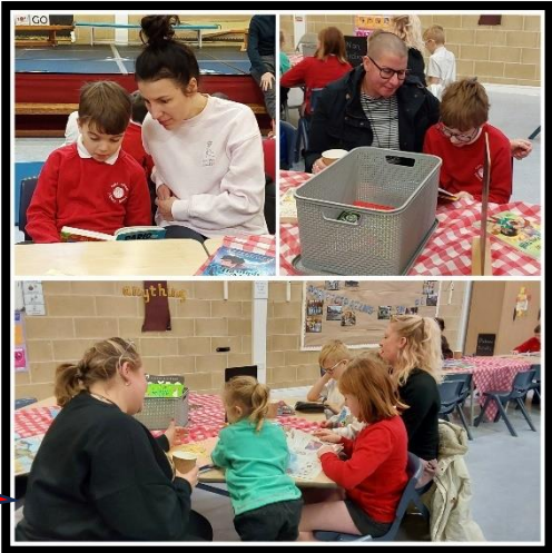
Our final Reading Café! Thanks to all that have attended the cafes.