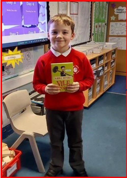
Day 3 of Beech Class's Book Advent Calendar