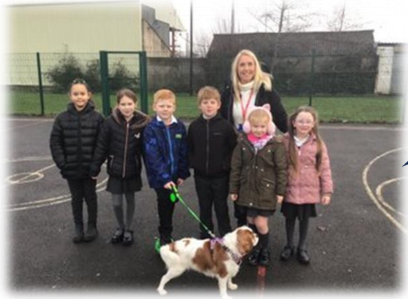
A lovely walk with Honey to the park..