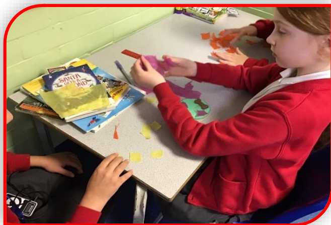
Rowan have been learning about fossils.