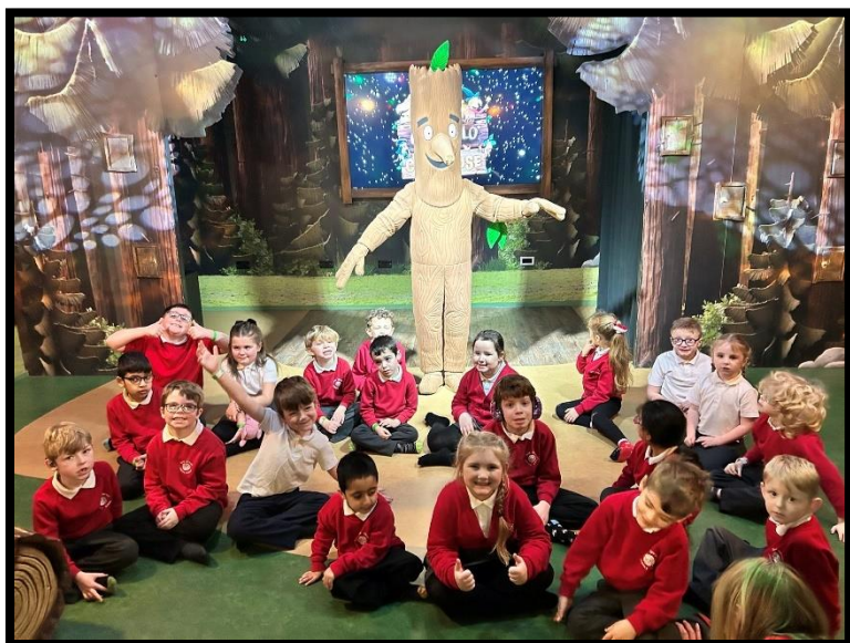
Acorn class had a fantastic visit to the Gruffalo Clubhouse in Blackpool.