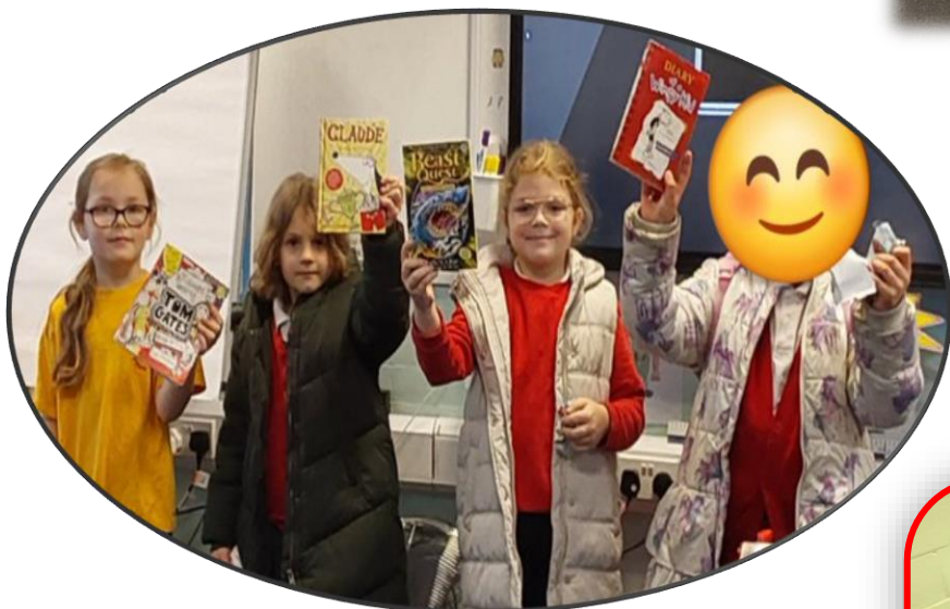
Beech class with books from Day 6.7.8 and 9 of the Book Advent Calendar