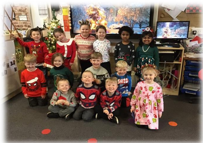
Happy Christmas Jumper day from Tulip class.