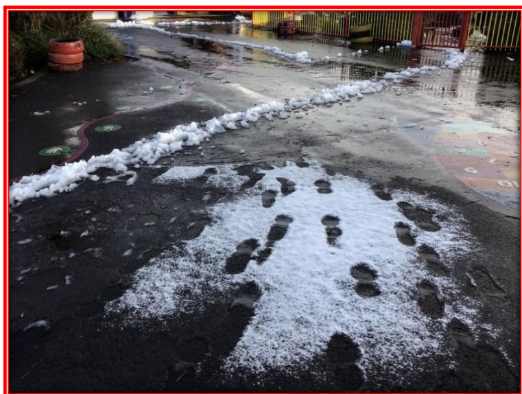
Reception children had fun painting snow and ice