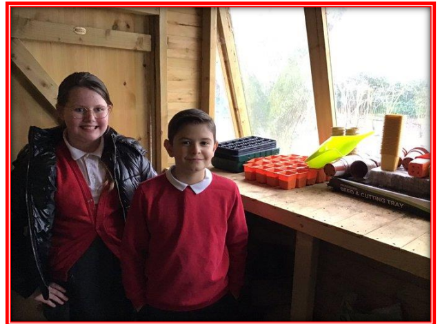
The Science Club Ambassadors helping to set out the planting equipment.