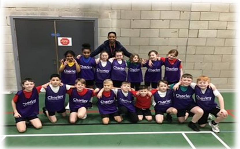
Well done Year 3/4 children who took part in the Sports Hall Athletics last night!