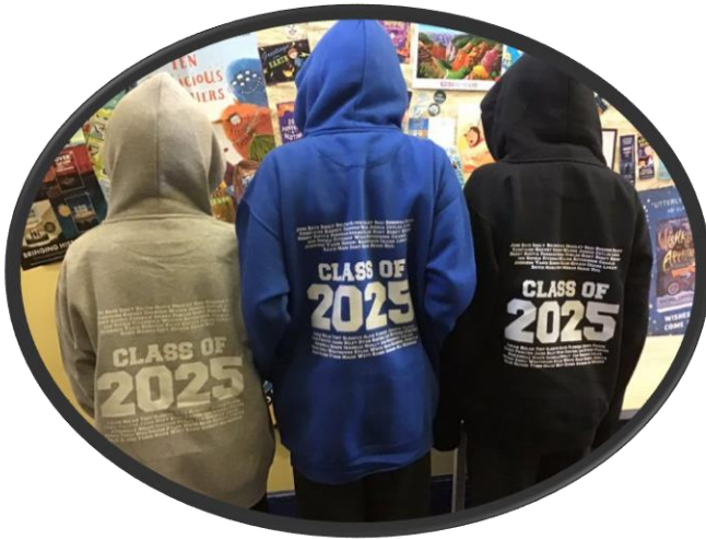
The Year 6 hoodies are here and the children love them!!