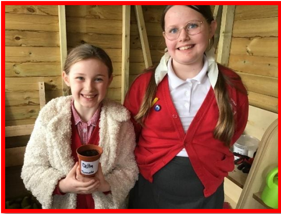
Planting Tomato seeds in Science Club