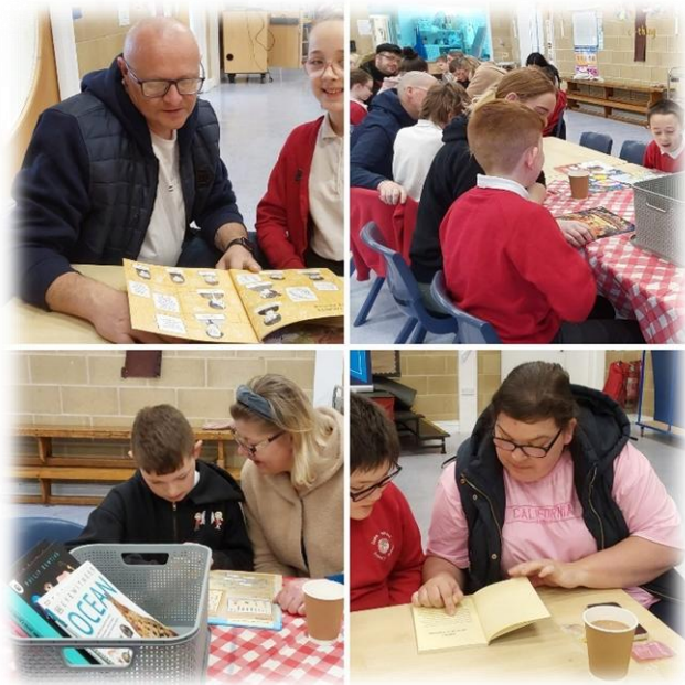
A lovely Reading Café session with UKS2