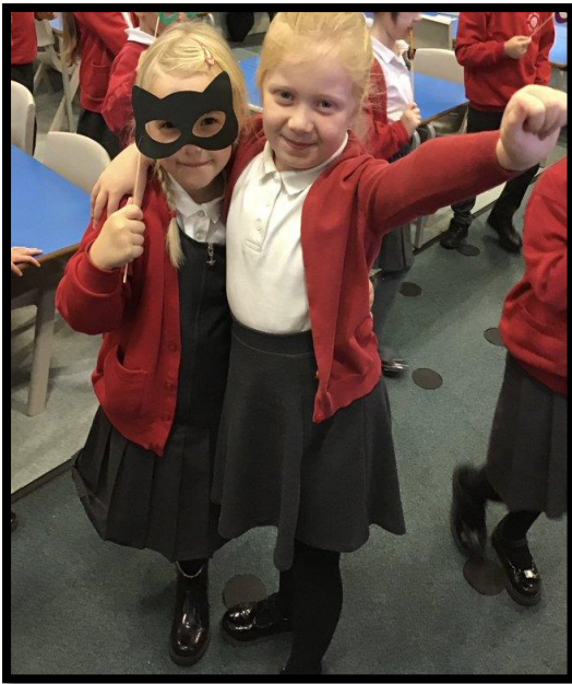
Superheroes in Acer class ready for Maths Quiz