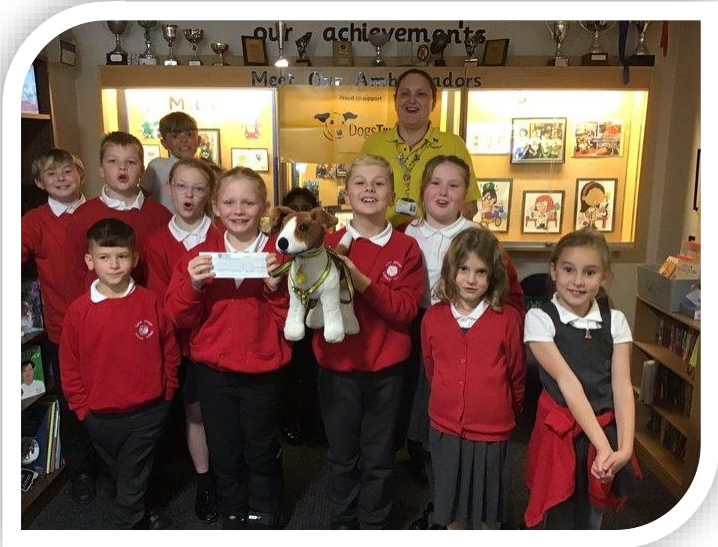
School Council handing over a cheque to Dogs Trust