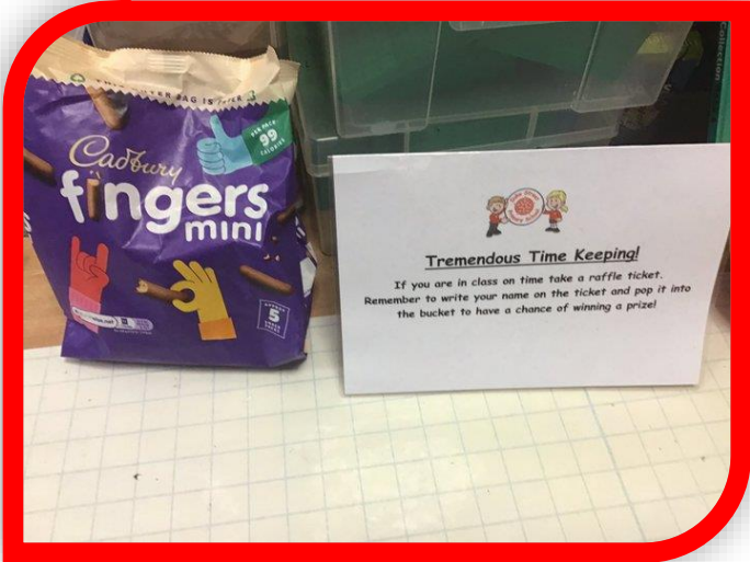
Well done Poplar class! Tremendous timekeeping!