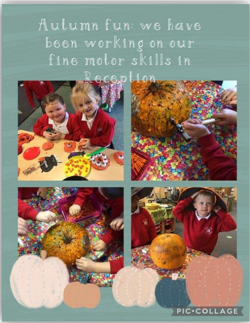
Developing fine motor skills in Reception