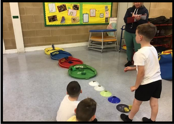
Year 2 enjoyed showing off their PE skills