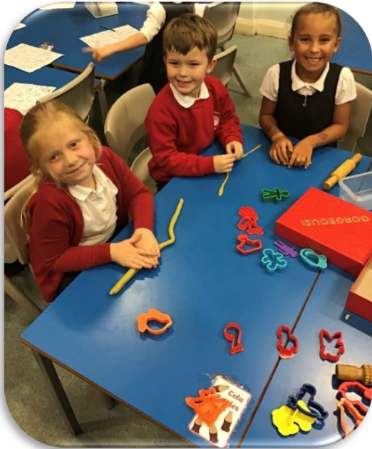
Acer class enjoyed spending time playing with toys..