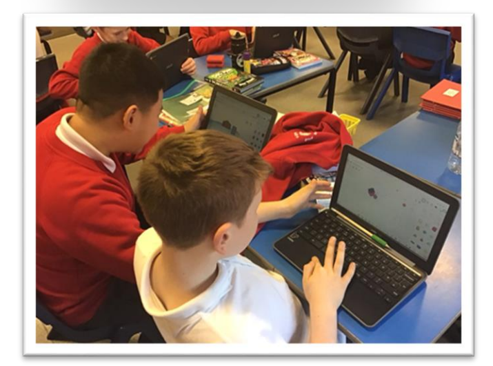
Chestnut children investigated Darwin's work on the Galapagos Finches.