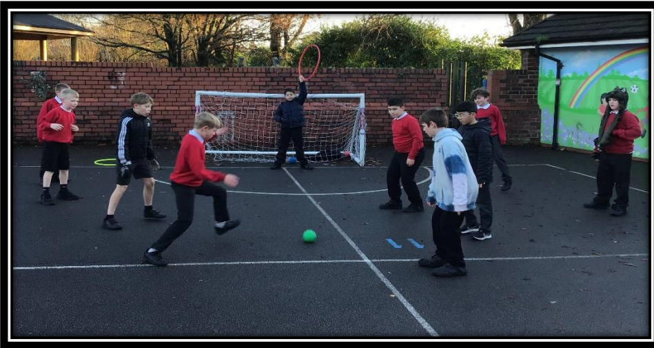
Sycamore Class learning about the Sports Mayans played