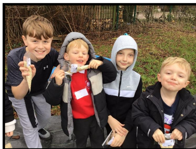
Time to Sparkle and Shine!