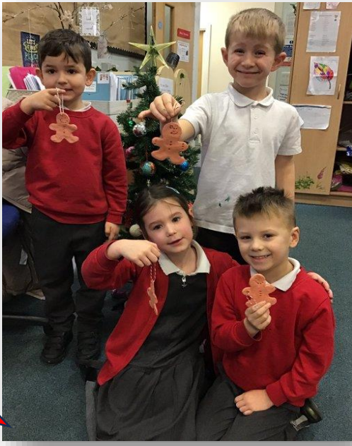
Acer Class made Christmas Tree Decorations.