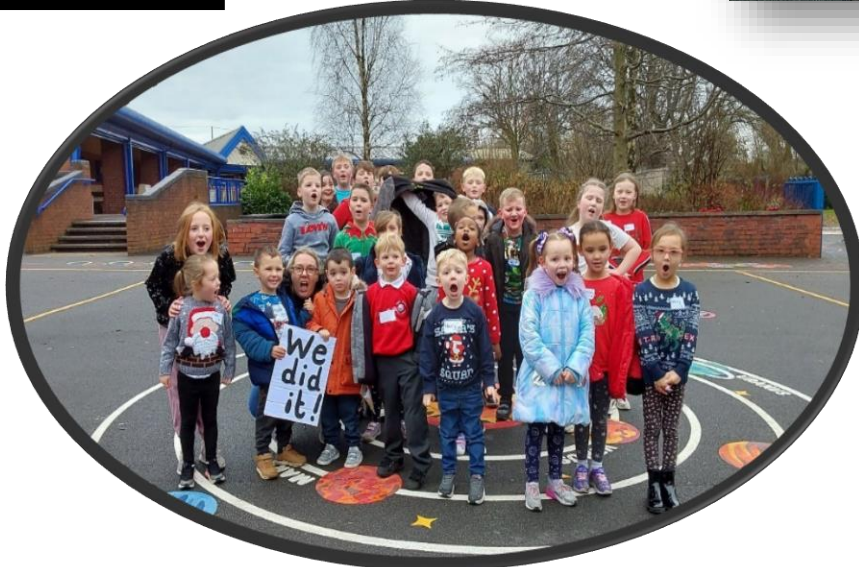
The children smashed the 105 mile target for our Jolly Jumper jog!