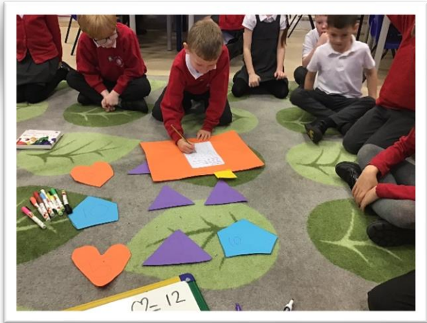
Great Maths lesson in Redwood solving a logical problem.