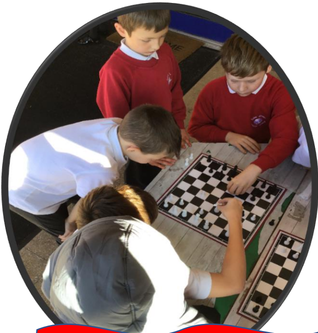
Learning to play chess with the Maths Ambassadors