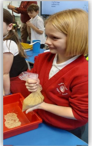
Maple class enjoyed replicating the digestive system yesterday...