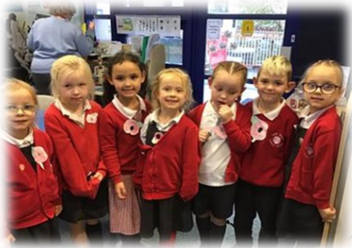
Acer class have been busy making poppies.