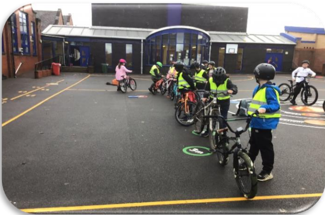
Children enjoyed their Bikabilty and P.A.S.T.A. sessions