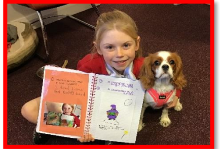
Honey has made lots of people happy this week