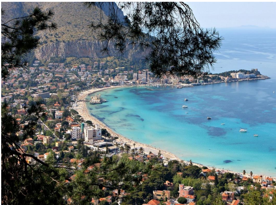
Figure 2: Photograph of the Sicilian coast, Italy.

How would a person view the Sicilian coast differently if: