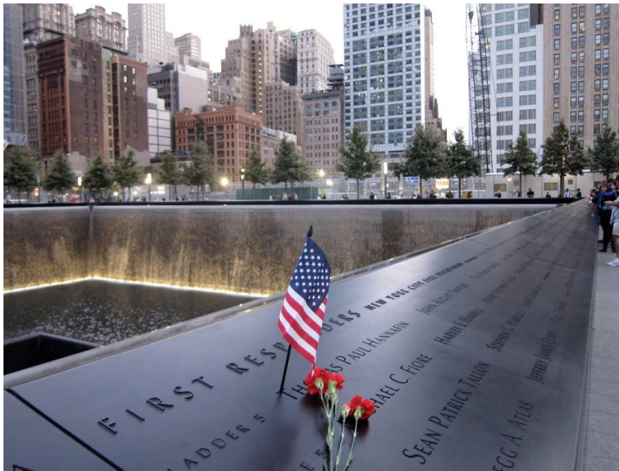
Figure 1: Photograph of the 9/11 Memorial & Museum site in New York City, USA.

How would a person view the memorial differently if: