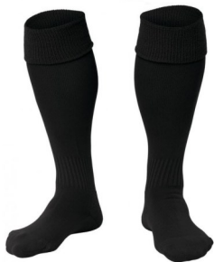
Plain black long game socks—for football and rugby