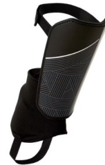
Shin pads for football