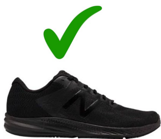
Black trainer, suitable for running

We understand that people have different feet sizes and shapes, and therefore need a specific size, brand and shaped shoe. We do however ask that trainers need to be predominantly black, and suitable for running. We ask for black trainers as black is a common and universal colour of many shoe brands, which also doesn't not show much dirt; and we also ask for a running style of trainer that would provide adequate support for student's feet during the activities in PE classes.