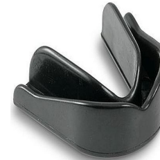
Gum shield for rugby