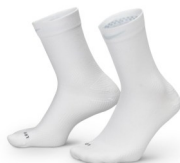
Plain white short (Crew) socks—for all other sports