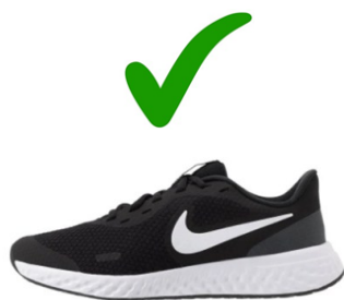
Black trainer with a small amount of white (predominantly black), suitable for running