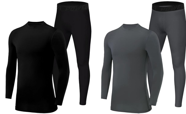
Grey / Black sport base layers for colder months