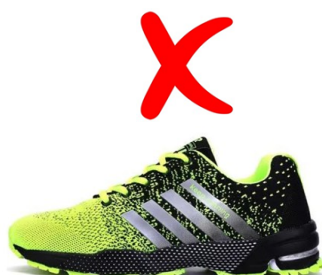
Black trainer with large amounts of another colour (not predominantly black), suitable for running