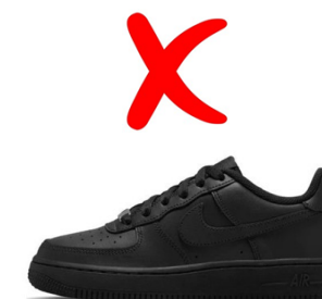
Black casual trainer, not suitable for running.