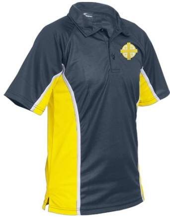
EFHS branded PE Polo—unisex or fitted