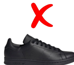
Black casual trainer, not suitable for running