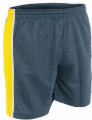
EFHS branded PE shorts can still be used while they are being phased out