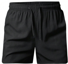
Plain black sports shorts—mid thigh length (no cycling shorts)