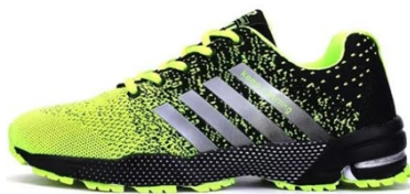
Black trainer with large amounts of another colour (not predominantly black), suitable for running