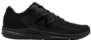
Black trainer, suitable for running