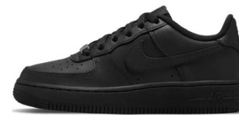
Black casual trainer, not suitable for running.