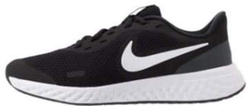
Black trainer with a small amount of white (predominantly black), suitable for running