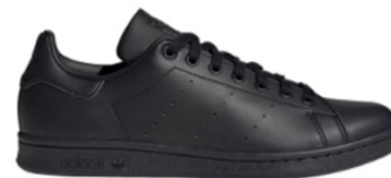
Black casual trainer, not suitable for running