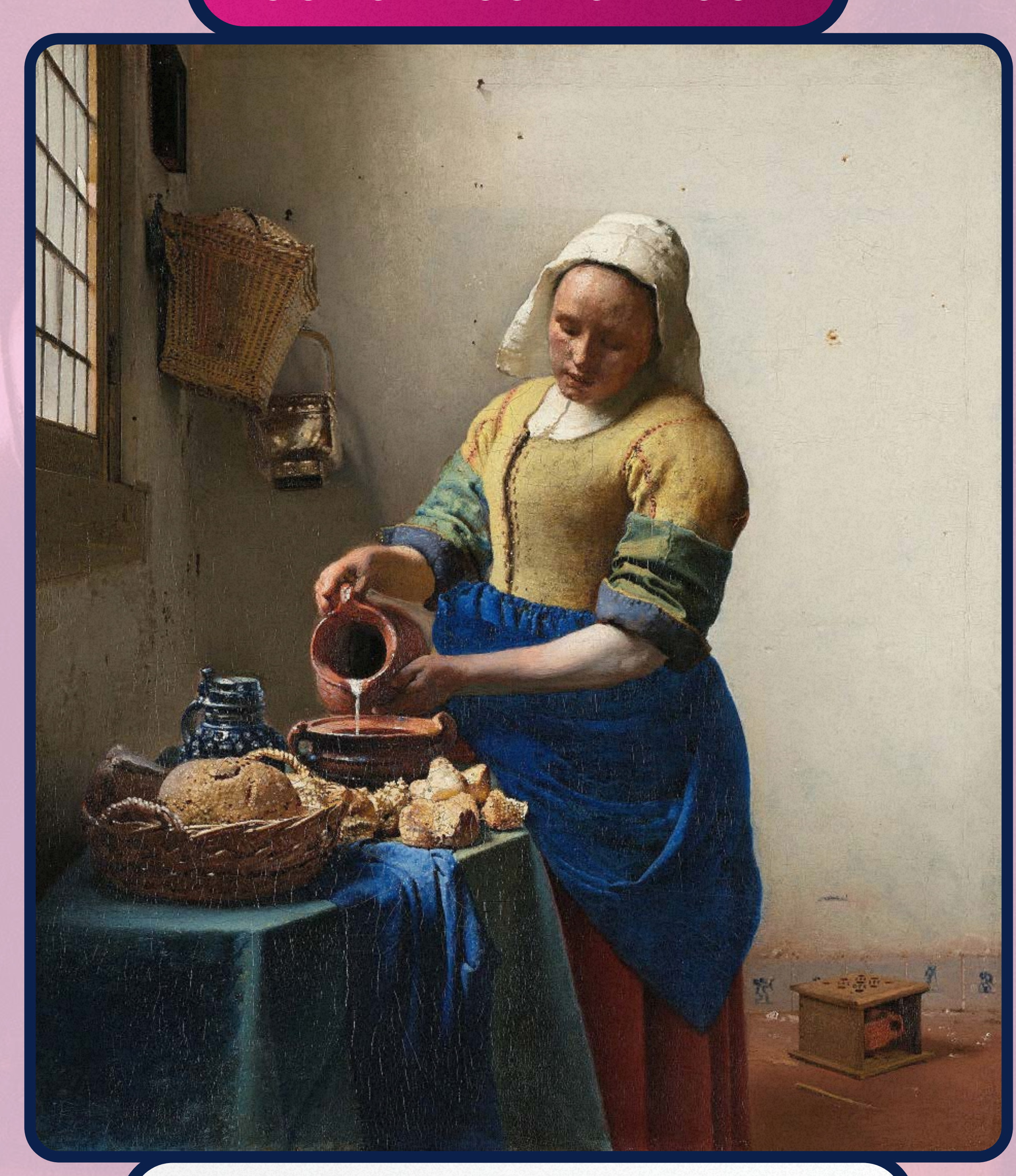
The Milkmaid c. 1658