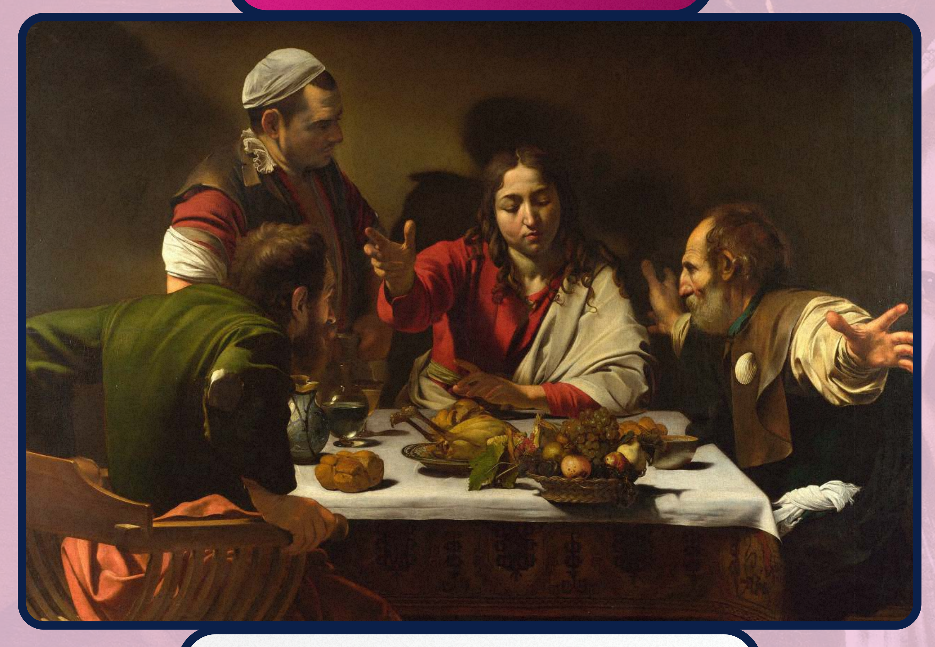
Supper at Emmaus 1601